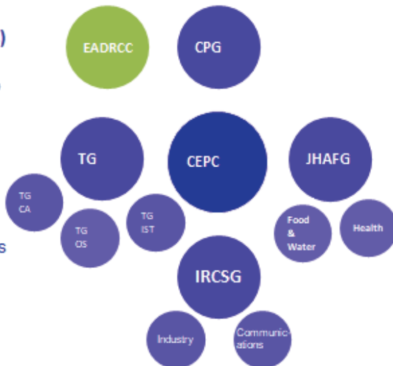
Fig. 2. The NATO Planning Groups and EADRCC

EADRCC = Euro-Atlantic Disaster Response Coordination Centre