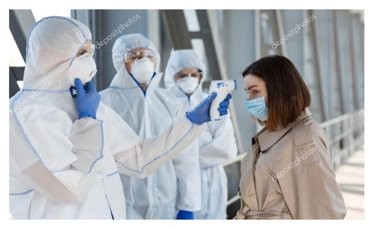
Fig. 1. Medical workers in protective suits

Thus, we usually perceive activities and things around us as processes, conditioned by other phenomena and processes, which we use to perceive the measurable, separate world. This world exists as an object, according to individual preferences. By perceiving it, one can "communicate" with others, although its perception is different for everyone. The reality seen in this way is highly unreliable. It is impenetrable. There is no consistency in it, as everything permeates everything else. In this context, the perception of a sense of security may reflect the real state of affairs (potential/real threat) or may be false - a misperception. A good example is the exaggerated fear of infection with COVID-19. However, a significant percentage of the population (approx. 26%) does not respect warnings related to the pandemic threats - is such a high number of respondents right? Misperception is the result of high complexity of security-related conditions, simultaneous reception of true and false information, as well as cognitive impairments of the perceiver (see the photograph below). These factors, but also the variability of the components of security, make it difficult to identify them or construct a general theory of undisturbed human existence and development.