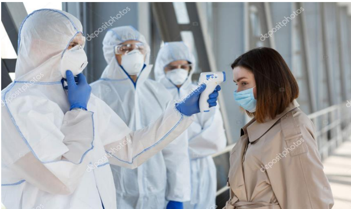
Fig. 1. Medical workers in protective suits

Thus, we usually perceive activities and things around us as processes, conditioned by other phenomena and processes, which we use to perceive the measurable, separate world. This world exists as an object, according to individual preferences. By perceiving it, one can “communicate” with others, although its perception is different for everyone. The reality seen in this way is highly unreliable. It is impenetrable. There is no consistency in it, as everything permeates everything else. In this context, the perception of a sense of security may reflect the real state of affairs (potential/real threat) or may be false - a misperception. A good example is the exaggerated fear of infection with COVID-19. However, a significant percentage of the population (approx. 26%) does not respect warnings related to the pandemic threats - is such a high number of respondents right? Misperception is the result of high complexity of security-related conditions, simultaneous reception of true and false information, as well as cognitive impairments of the perceiver (see the photograph below). These factors, but also the variability of the components of security, make it difficult to identify them or construct a general theory of undisturbed human existence and development.