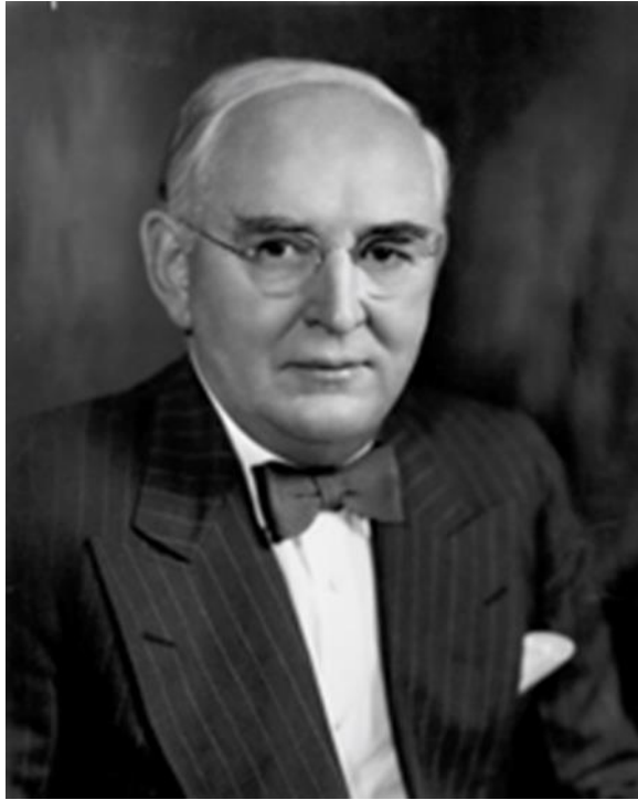
Fig. 3. Senator Arthur H. Vandenberg