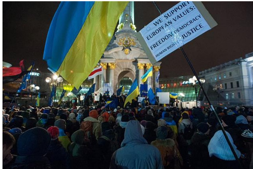
Fig. 4. Euromaidan protests