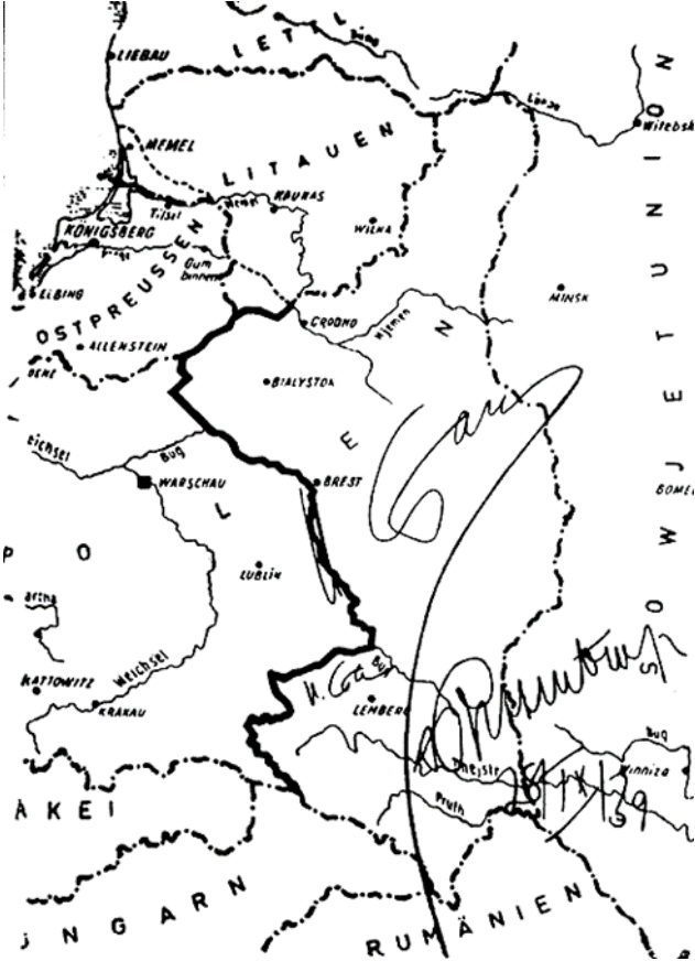
Fig. 1. Map of Poland signed by Stalin & Ribbentrop adjusting the German-Soviet border

Will the US, Europe, and NATO be able to remain united and sustain the strong support for Ukraine in the long term for the massive funding needed for economic assistance and military assistance, infrastructure reconstruction, and refugee assistance?