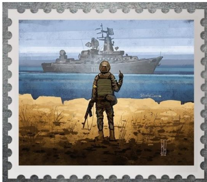
Fig. 6. Ukrainian defender at Snake Island and the Moskva