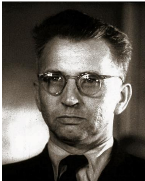
Fig. 2. Polish Home Army General Leopold Okulicki

Soon after the Pact, the Soviet Army, NKVD secret police, and communist commissars rolled into Poland, captured thousands of Polish officers and intelligentsia, and deported hundreds of thousands to Russian prisons. In 1940 over 22,000 Polish officers and leaders were executed by the Soviets in the Katyn Forest.