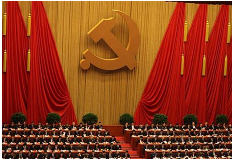
Fig. 5. Xi has centralized power in the Chinese Communist Party and there won't be any 'no' votes.