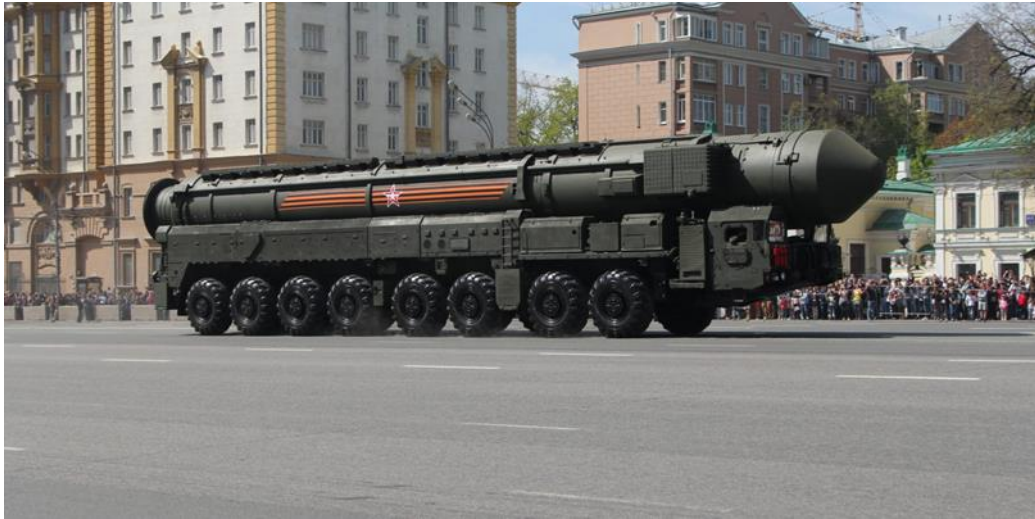
Fig.3. RS-24 Jars ballistic missile (SS-27 Sickle Mod. 2) on a mobile launcher.

them. In formal terms, the missiles feature a new design that was developed in response to the US unilateral withdrawal from the ABM Treaty. 4