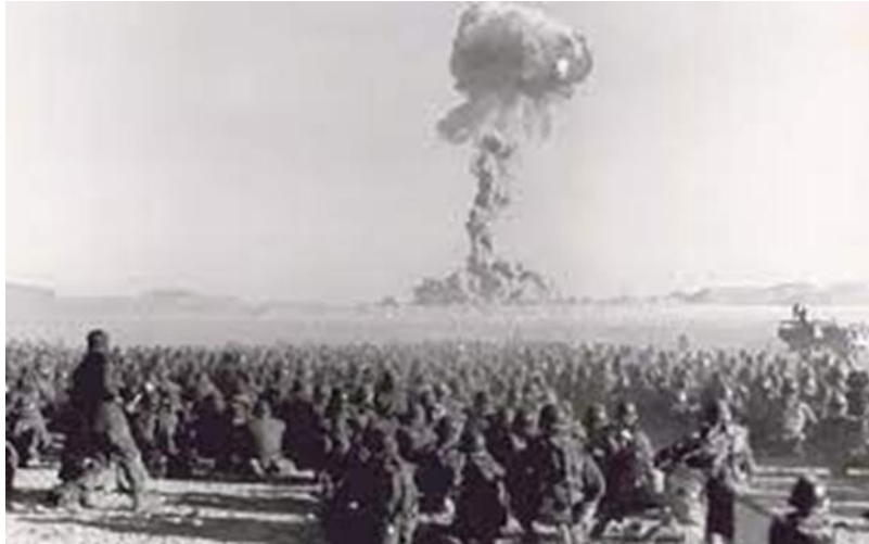
Fig.2. Manoeuvres under the cryptonym Snezhok

reported later: “I was told to hide my rifle underneath because the temperature might cause the barrel to bend. I thought: if the rifle can be destroyed, what about me? When the commanders left, I moved to a dugout next to a deep trench where sheep stood tied to stakes. The explosion caused severe burns on the animals. Their wool was burnt. Not even a trace was left of my trench. The blast had levelled the area. The whole ground was strewn with dead birds.” Hidden in the bunker, the marshal and the delegates watched the explosion and its aftermath through a periscope. No one was concerned about the Kazakh villages located about 5 km from the epicentre. Their residents were not informed about the exercise or the effects of the explosion.