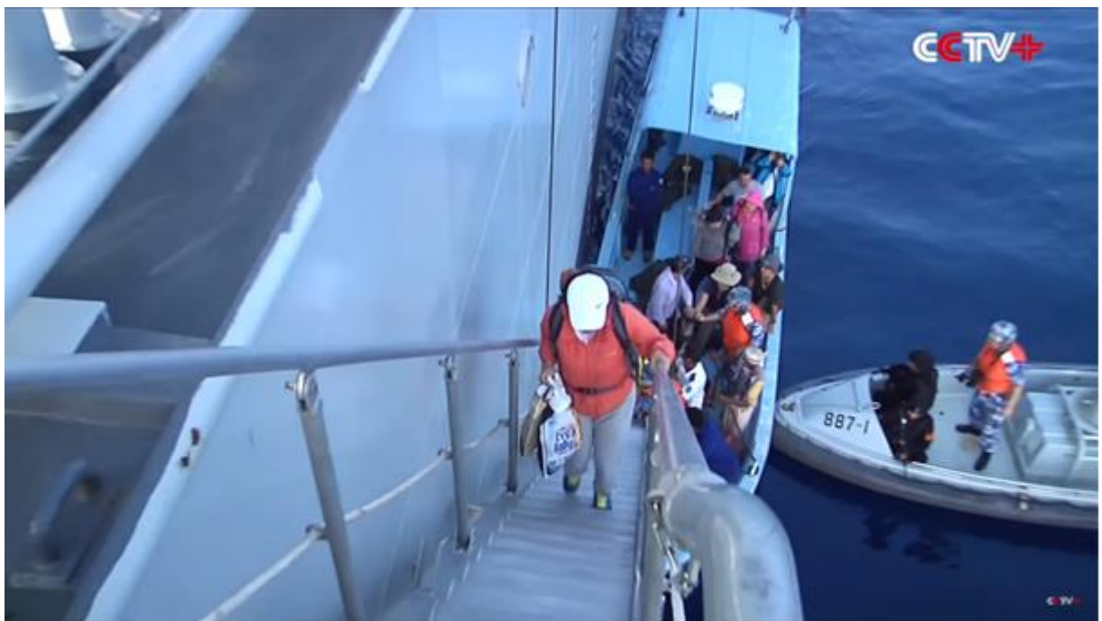
Fig. 8. Last Chinese citizens evacuated from Yemen on 7 April 2015 boarding the Weishanhu supply ship

According to official Chinese data, during the operation, between 29 March and 7 April 2015, 629 Chinese citizens and 279 foreigners were successfully evacuated. Throughout the operation, no 30 direct interaction of the fighting parties with the evacuated parties and the forces conducting the NEO operation was recorded.