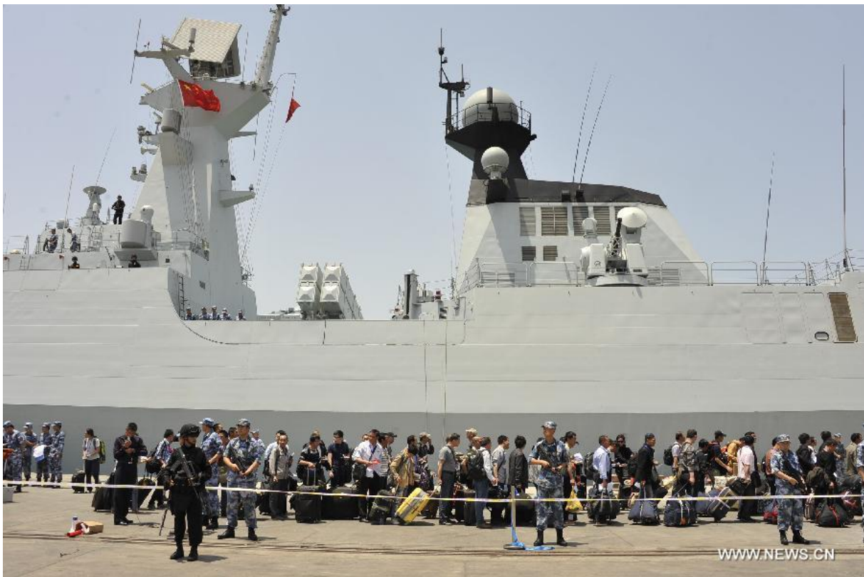
Fig. 4. Chinese citizens awaiting in line to board at the port of Aden. 2 April 2015

The execution phase began on 29 March 2015, when the first group of 122 Chinese citizens was evacuated from the port of Aden to the temporary safe place in Djibouti. A day later, the evacuation of another 449 Chinese citizens who, at that time, were employees of twelve Chinese enterprises operating in Sanaa, followed. In addition to Chinese citizens, the evacuated group also included eight foreigners employed by Chinese companies. The evacuees first took a five-hour journey from the evacuation point in Sanaa to the boarding place in Hudaydah by their own means of transport, or by buses organized by the embassy. There, they boarded the PRC Weifang frigate , and were then transported by sea to Djibouti 21 .