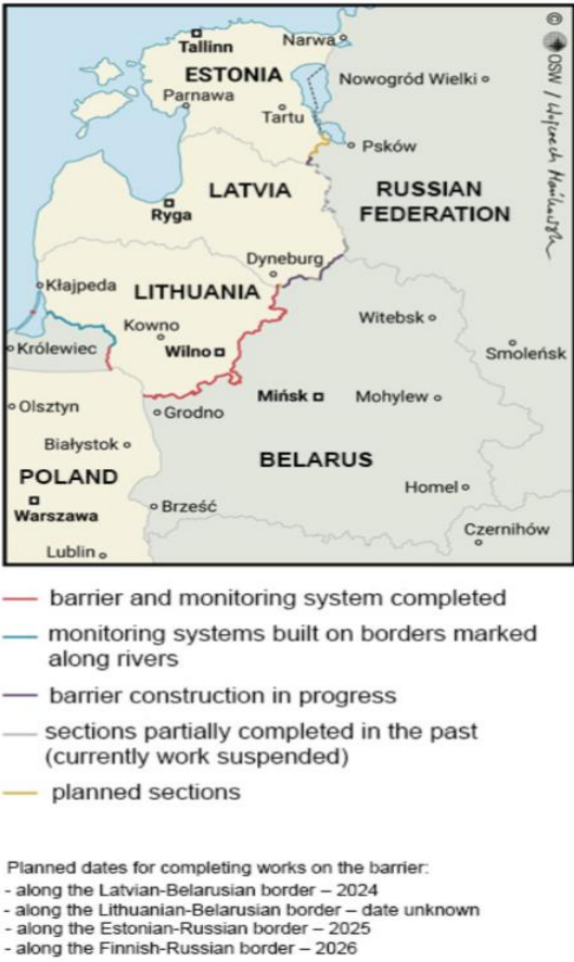
Fig. 3: Status of development of border barriers in the Baltic states

For this reason, since 2017, Lithuania has built a 45-kilometer-long two-meter-high fence equipped with an electronic monitoring system along the border with Russia. In 2022, works related to the installation of a fence along a length of approximately 550 km on the border with Belarus were completed. In spring 2023, Lithuania completed the installation of electronic monitoring systems on the border with Belarus. ( Gudavičius , 2017). In Latvia, in 2023, two stages of the construction of the fence on the border between Latvia and Belarus were finalized, with a total length of 149.7 km. The entire investment is to be completed by the end of 2024. The barrier on the Latvian-Russian border is under construction. In the previous stage (until 2019), patrol roads were built on 230 km of the border and 90 km of fencing was built. The next stage of construction is planned for 2025, which will cover the remaining 180 km of fencing and 53 km of patrol roads (Chmielewski, Tarociński , 2023). Meanwhile, Estonia officially decided to build the Russian section from 2021, which is to be 135.6 km long. The construction project is divided into three basic stages, in which approximately 115 km of barrier will first be built. The first test section (23.5 km) was completed in 2022, and the second (approx. 40 km) in 2023. Work on the third section, approximately 50 km long, is planned for 2024 (Chmielewski, Tarociski, 2023).